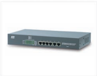
KPOE-100 : PoE PSE mid-span injector